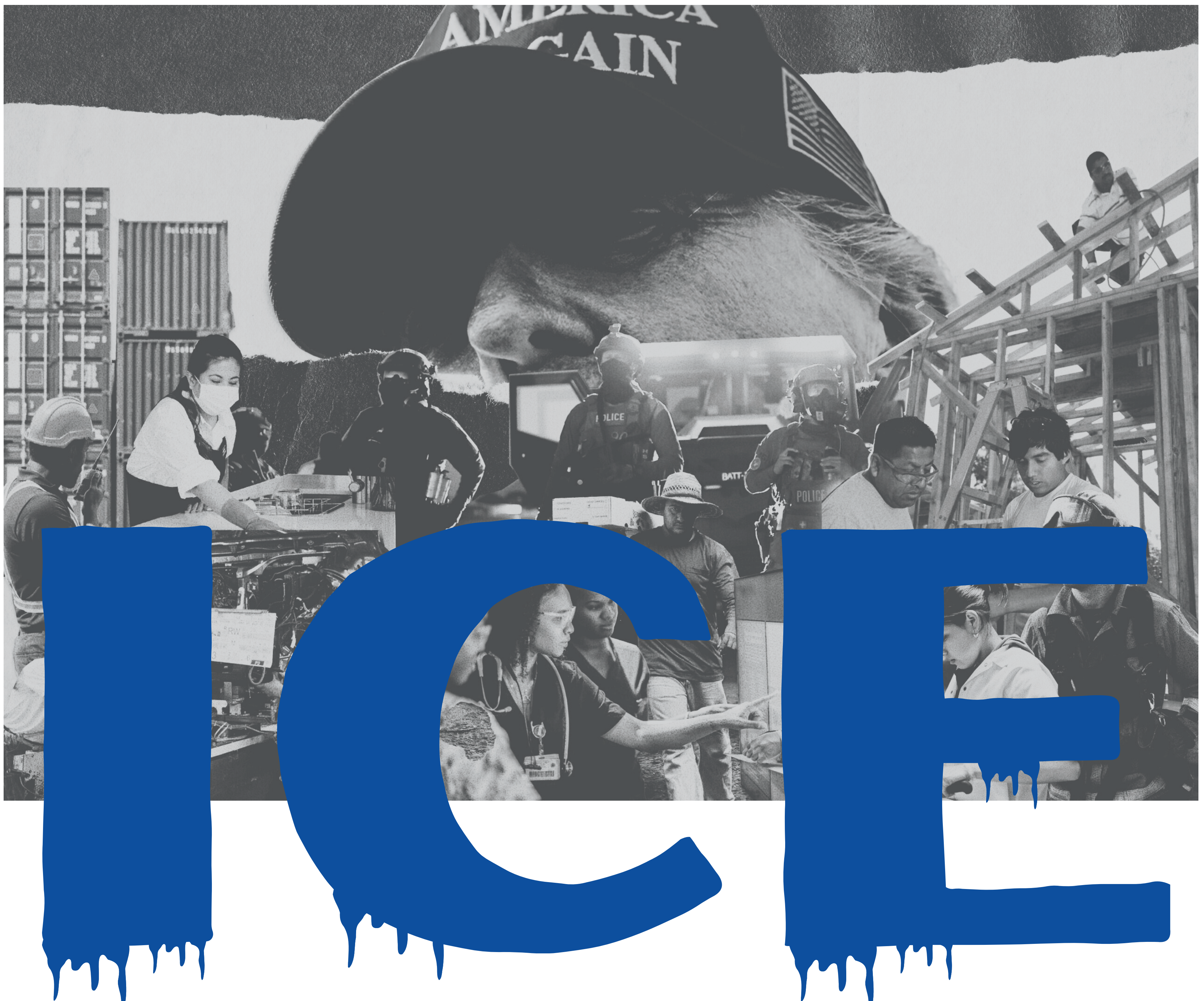
Illustration by Tevy Khou

JAN 13, 2026 5PM - 7PM MERRILL CULTURAL CENTER, UC Santa Cruz & Online